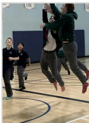
RNS Game On! Group in the gym with Teen Mentors

Game On! Eat Smart, Play Smart, Live Smart program provides boys and young men with information and support to make informed choices about a range of healthy lifestyle practices. The boys learn about life skills, communication and emotional health challenges through non-traditional activities in a group setting with adult or teen mentors.