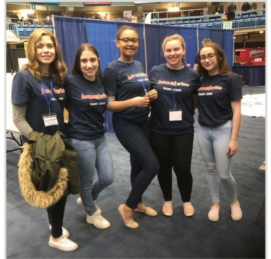
A group of Go Girls! Friendship Club volunteers at the Amazeatorium in 2019.