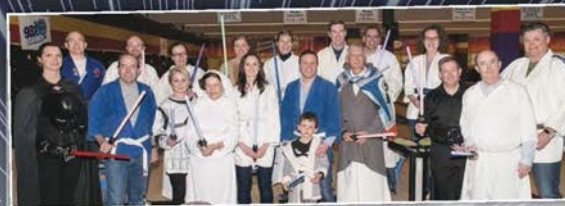
J.D. Irving, Limited - "The Empire Strikes Back"