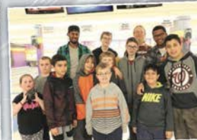
MENTOR Links Participants and Volunteers