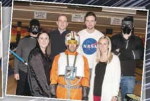
JDI Sawmills "The 2 By Force"